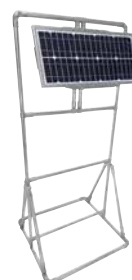
SolarPak Charger (optional)